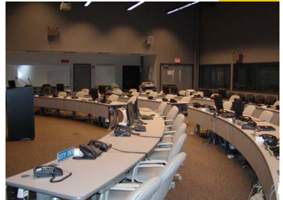
Monroe County Emergency Management Control Room