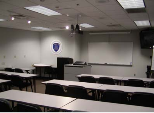
Classroom at Monroe County's Public Safety Training Center